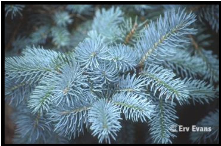
Colorado blue spruce picea_pungens