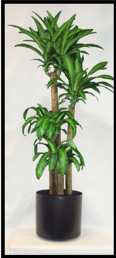
Corn Plant Dracaena Fragrans