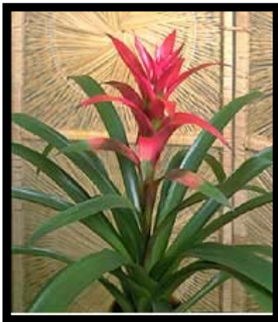
Bromeliad Pitcairnia feliciana