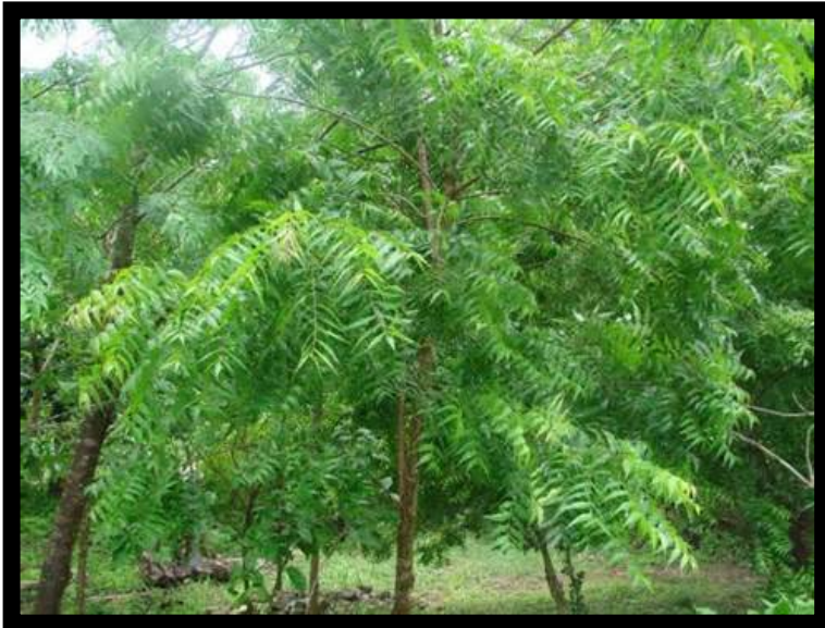
Neem Tree Azadirachta indica

An insect repellent especially effective on stored grain insects.