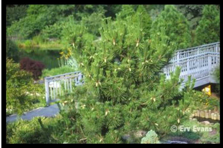
Black Japanese Pine Pinus thunbergiana