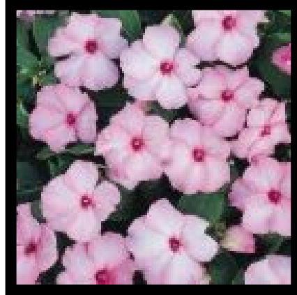
Impatiens Impatiens zombensis