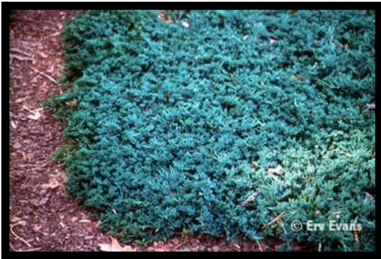
Blue Rug Juniper Juniperus horizontalis