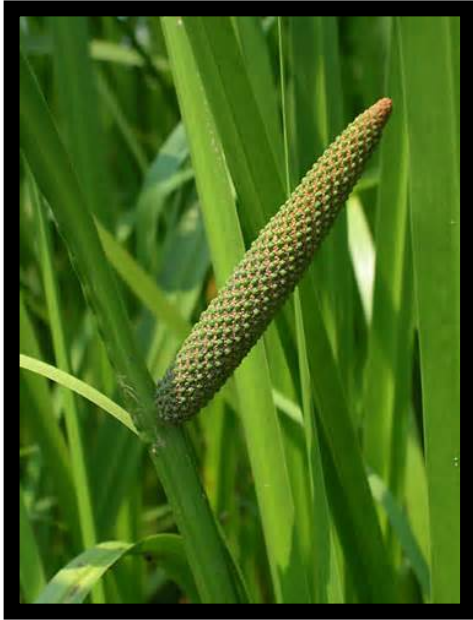
Calamuse Acorus calamus

An insect repellent especially effective on stored grain insects.